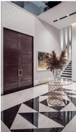
Floor Care Range