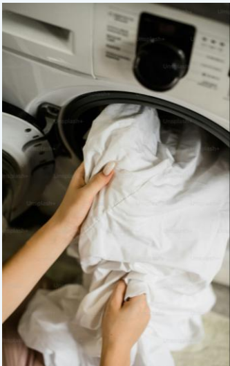
Emulsifier & Detergent

Fresiqo brings a smart and effective approach to fabric care. This line includes detergents, fabric softeners, stain removers, and disinfectants that deliver deep cleaning, softness, and long-lasting freshness – all while protecting fabric integrity and optimizing wash cycles.