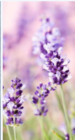
Air Freshener Range