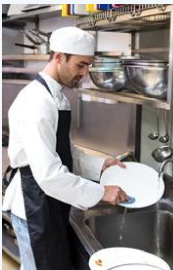
Dish washing Range

Viwanta is tailored for the demanding hygiene standards of commercial and industrial kitchens. This range includes powerful degreasers, dishwashing agents, surface sanitizers, and equipment cleaners – all designed to cut through grease, eliminate pathogens, and comply with food safety norms.