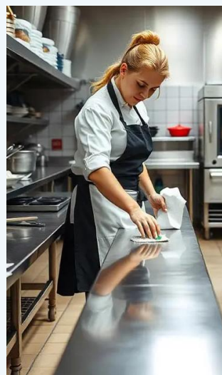
Kitchen Surface Cleaner