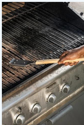
Grill & Oven Cleaner