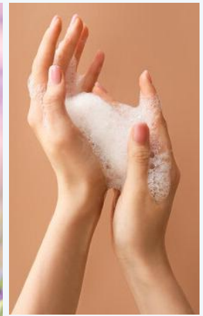
Personal Care Range