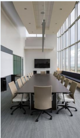
Room Care Range

Hyginix is our dedicated range of housekeeping chemicals, formulated to ensure spotless, germ-free, and fresh-smelling environments. From floor cleaners and surface disinfectants to glass cleaners and washroom hygiene solutions, Hyginix ensures every space reflects cleanliness, comfort, and care.