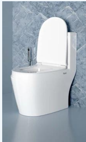
Washroom Care Range